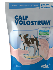
Sold in 450g individual pouches or 20 x 225g sachets in a white labelled tub.

A nation wide study was also undertaken using over 40 farms and Colleges. More than 750 calves were involved. The trials demonstrated that Volostrum was a highly effective substitute for colostrum, they also commented on how easy the product was to use.