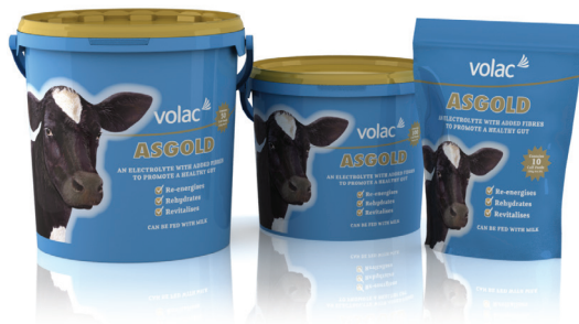
Sold in 5kg and 2.5kg tubs and a 500g pouch